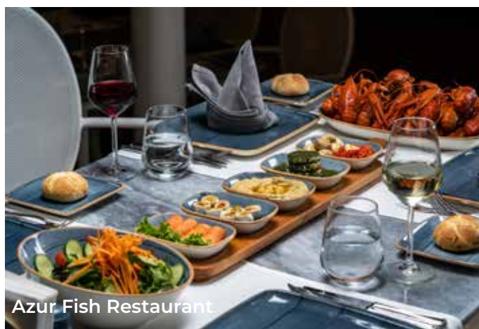
Azur Fish Restaurant

* A maximum of 8 people per table can be accommodated.