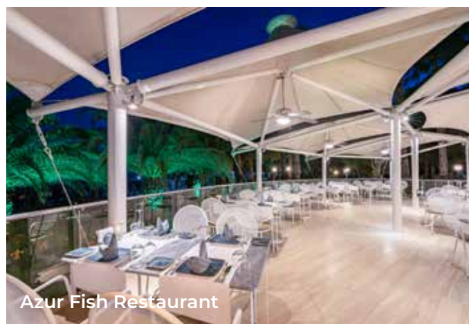
Azur Fish Restaurant